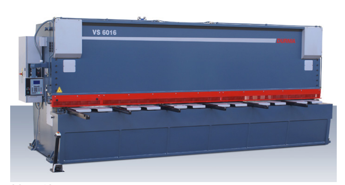
20' X .625