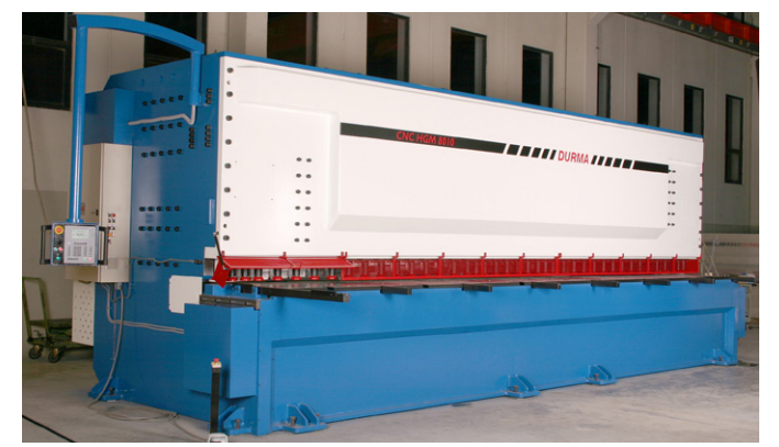
26' X .375