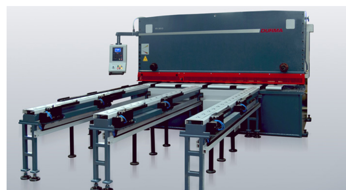
FRONT FEED SYSTEMS - TYPE 2