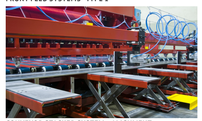
CONVEYOR STACKER SYSTEM + ALIGNMENT