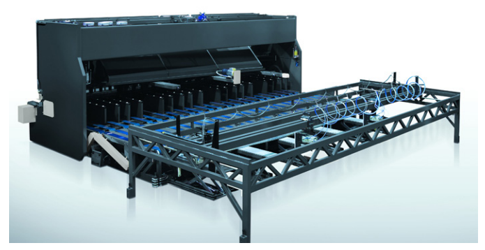
CONVEYOR STACKER SYSTEM + ALIGNMENT