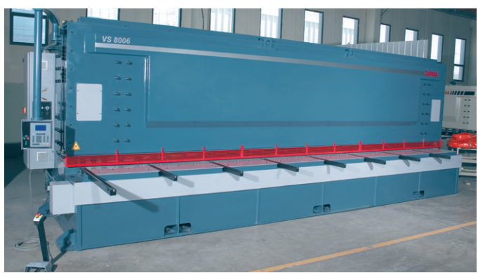
26' X .250 WITH PATENTED BLADE CLEARANCE