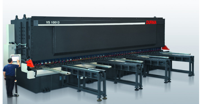
FRONT FEED SYSTEMS - TYPE 1