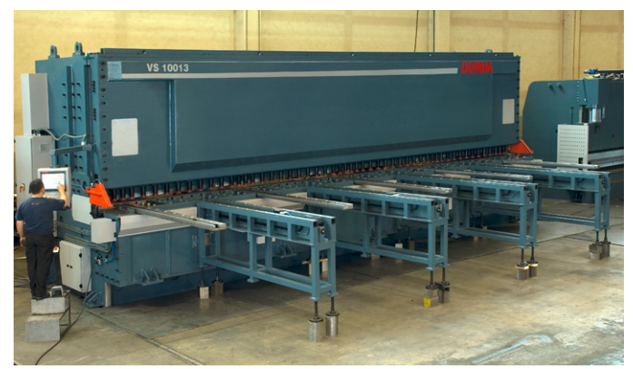
30' X .500