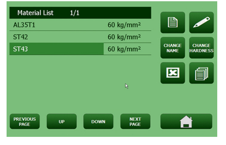
MAIN MENU MATERIAL LIST